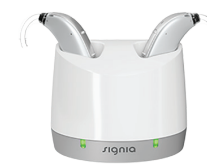
Signia Motion Charge&Go X P