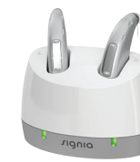
Signia Motion Charge&Go X SP