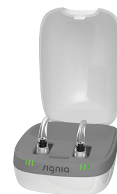
Signia Motion Charge&Go X

All Motion Charge&Go X models work exclusively with the new Ear Wear 3.0. Contact your Signia Representative to learn more about the new Ear Wear 3.0. Upgrade to the Dry&Clean Charger at purchase for Power and Super Power.