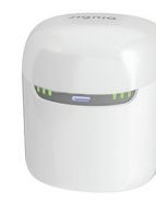
Signia Dry&Clean Charger option for P & SP